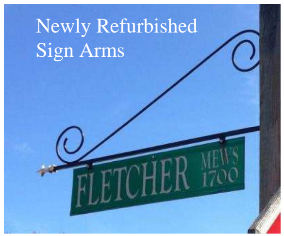
Newly Refurbished Sign Arms