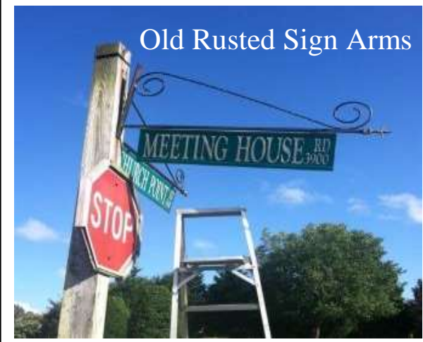
Old Rusted Sign Arms