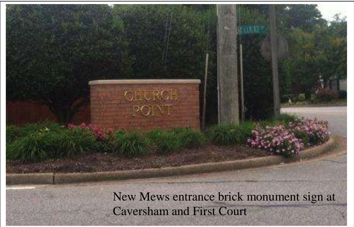
New Mews entrance brick monument sign at Caversham and First Court