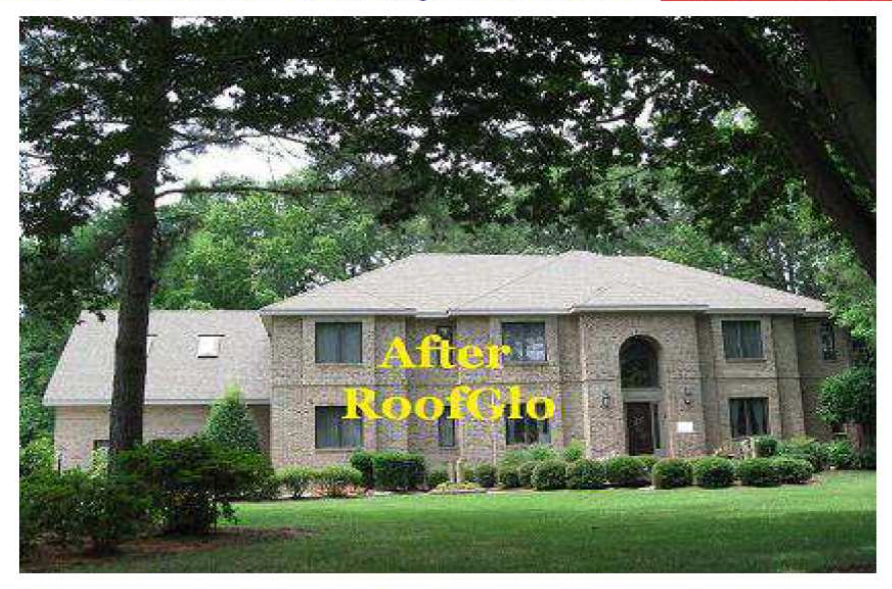
Why HOAs and Homeowners Across Virginia Choose RoofGlo™:

The horrific stain that is rapidly growing on your roof is a scabbard or protective covering formed by an aggressive algae, called Gloeocapsa Magma. Gloeocapsa Magma not only <u>destroys your home's appearance</u>, it feeds on limestone (a valuable component in the asphalt shingle composition) and <u>can affect the lifespan of your roof</u>.