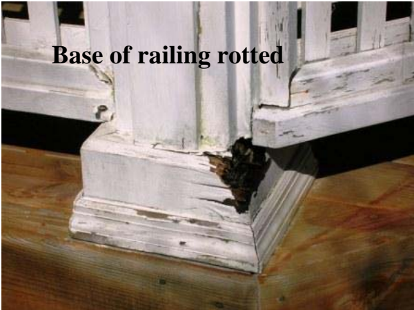
Base of railing rotted